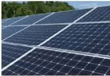
Solar Power System