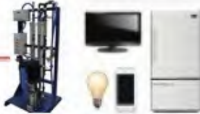
Fresh Water - Appliances