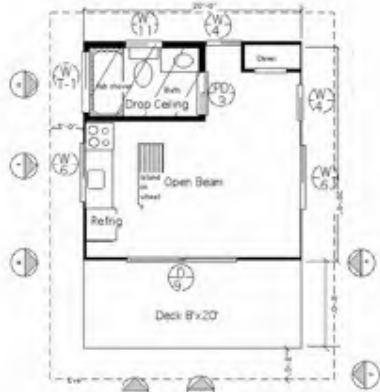
Main Room Custom Home Design